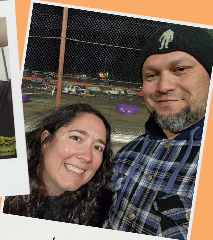
Another Demo Derby