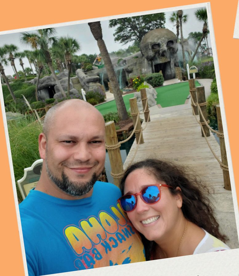
More Mini Golf in Myrtle Beach