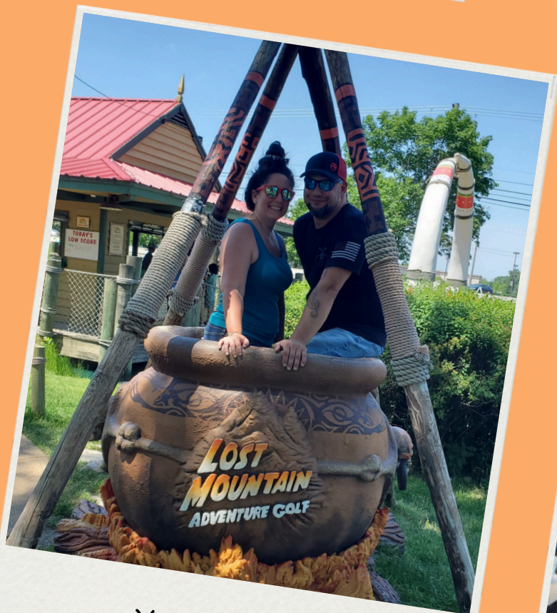
Yup, Mini Golfing