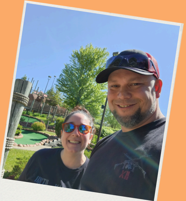
More Mini Golf!!