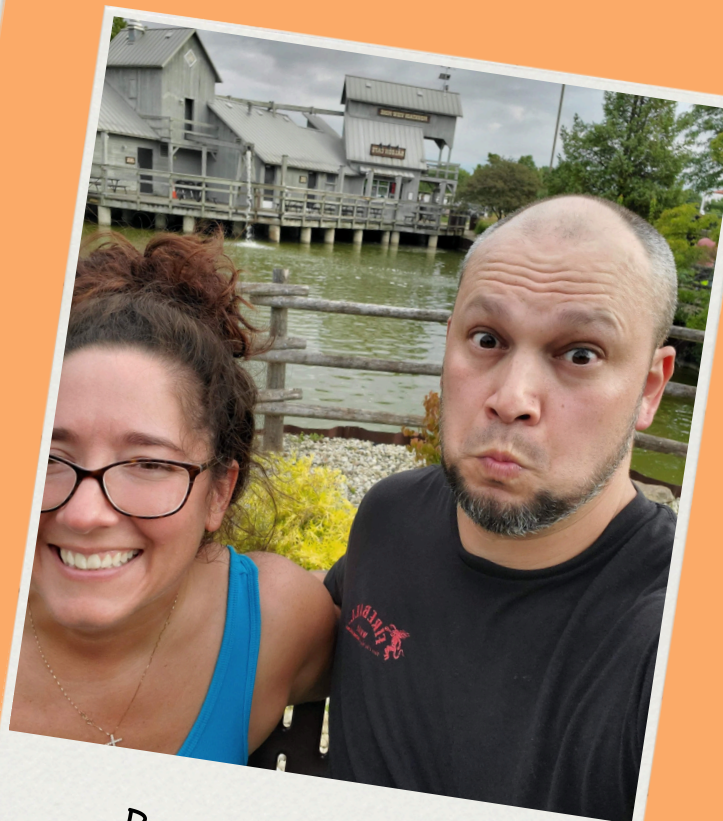
Being silly while Mini Golfing