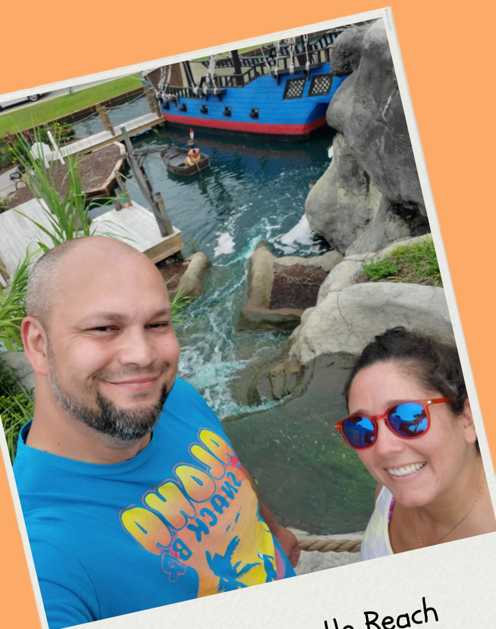
Mini Golf in Myrtle Beach