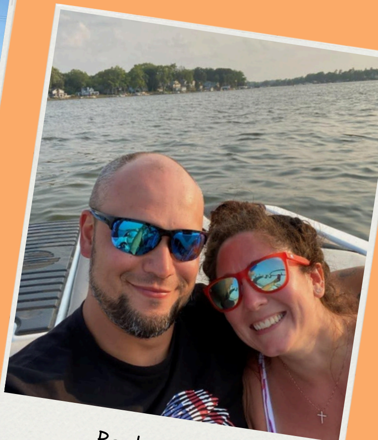
Boating on the Chain of Lakes