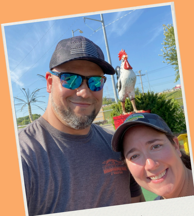
Mini Golf !!