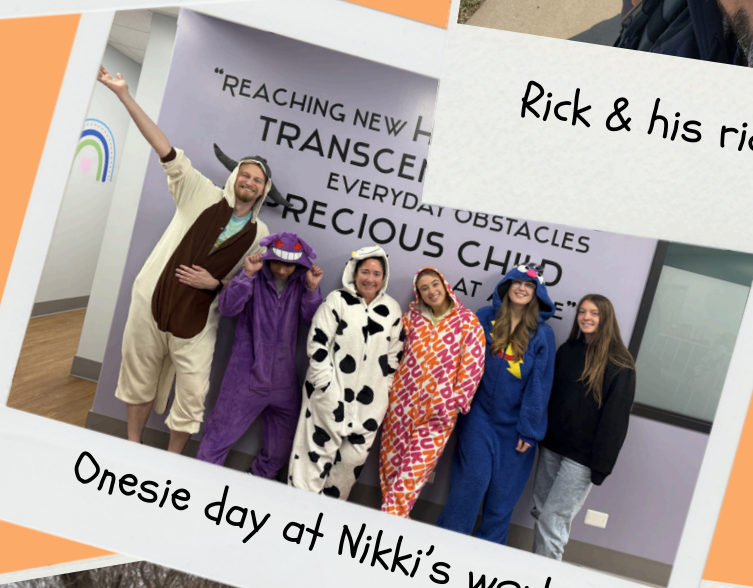
Onesie day at Nikki's work