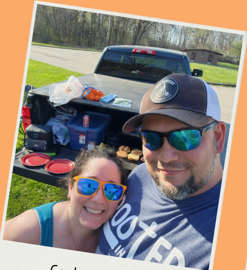
Cook out at the forest preserve