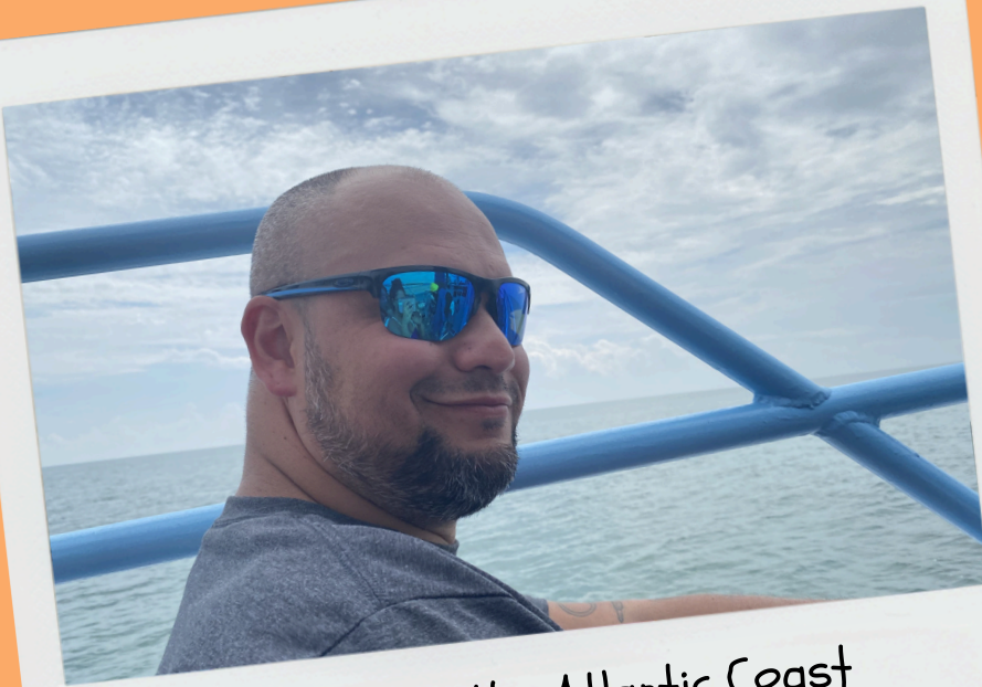
Boat ride on the Atlantic Coast