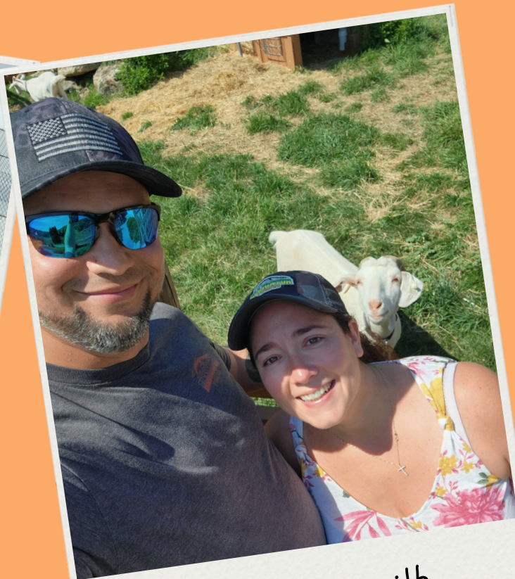
Mini Golfing with goats