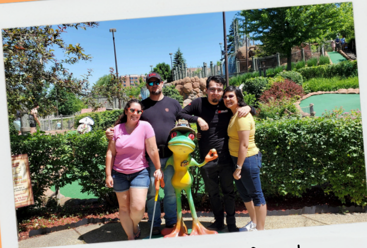
Mini Golfing with friends