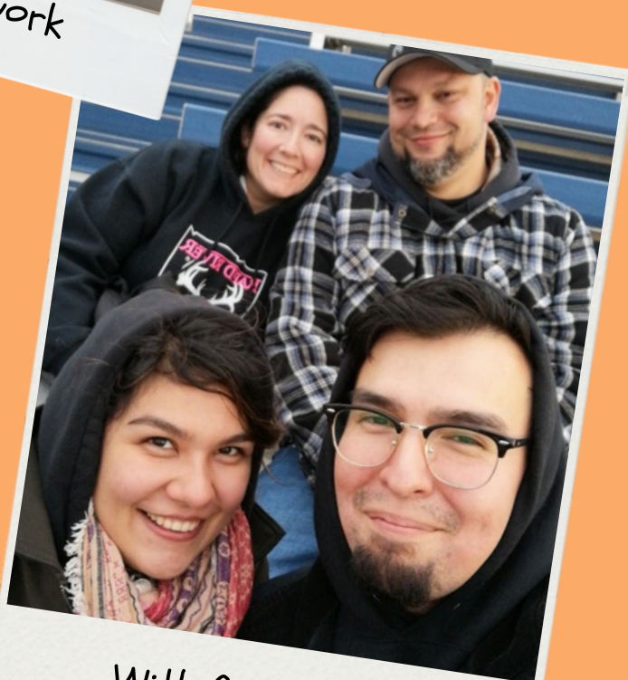
With friends at Tractor Pull