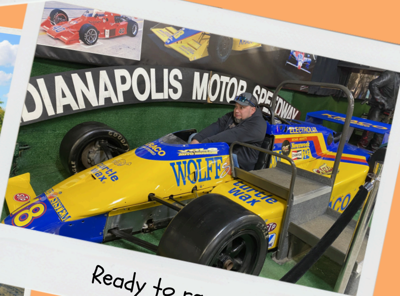
Ready to race