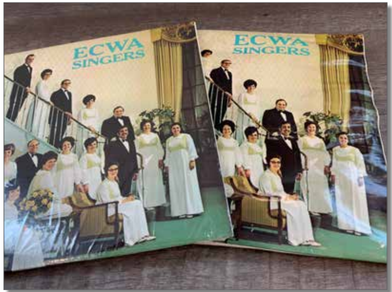
On the left is the almost new album brought in by Leo. On the right you can see the water damaged copy we have that survived the fire.