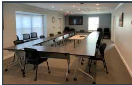
Large Conference Room →