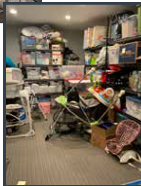
Pregnancy Support Services Closet →