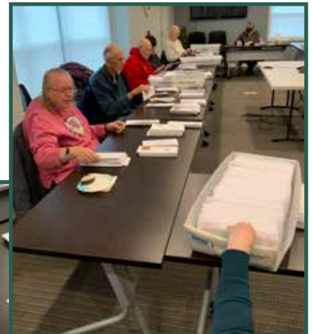
Some of our regular mailing volunteers working on the Christmas letter.