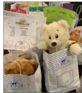
Bears donated by Wheaton Christian Grammar School.

Thank you to all the students for your service and donations.