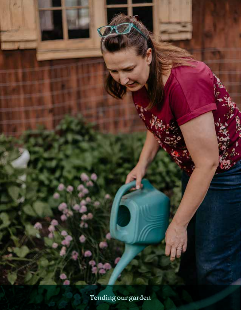
Tending our garden