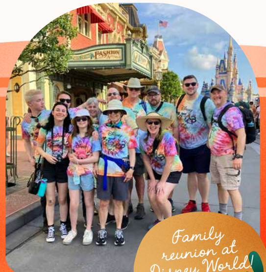
Family reunion at Disney World!

When we are not out exploring, we also love to be home and enjoy playing a game or watching a funny show together.