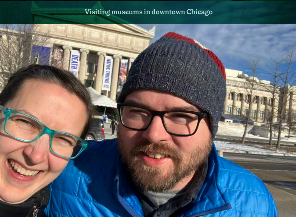
Visiting museums in downtown Chicago