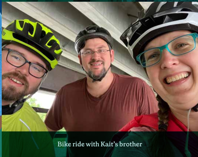
Bike ride with Kait's brother