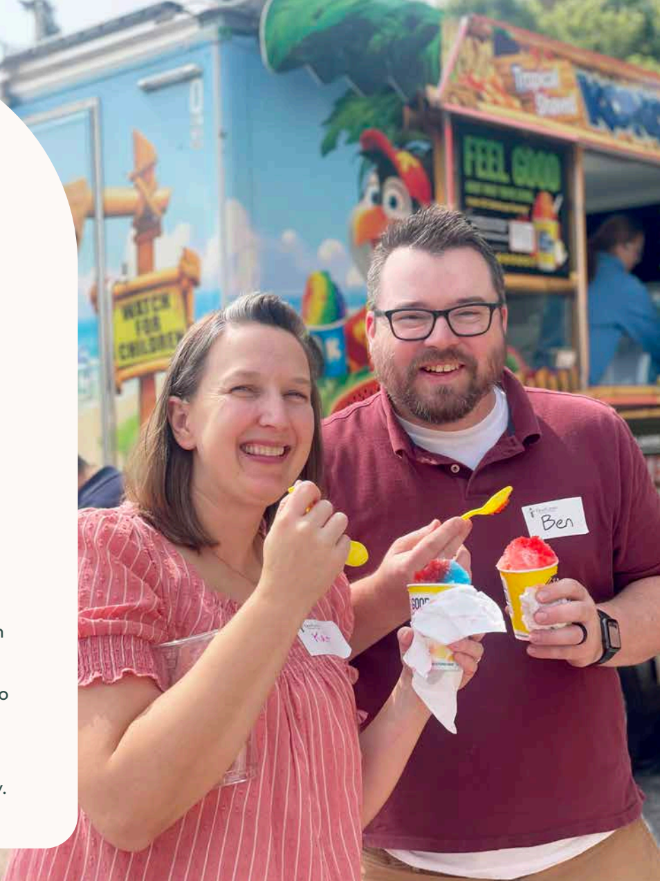
After competing in our triathlon events for a fundraiser

After years of trying and experiencing several pregnancy losses, we believe adoption is the path meant for us to grow our family. Adoption has always been on our hearts, and while we know it comes with unique challenges and blessings, we are excited for the possibility it holds. We've also seen close friends walk this path, and their experiences have shown us how beautifully adoption can transform and enrich a family.