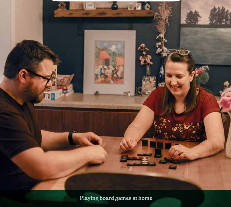
Playing board games at home