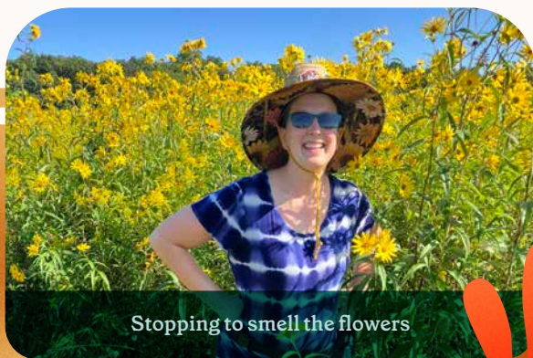
Stopping to smell the flowers

My own mom passed away when I was very young and I am beyond grateful for the many surrogate mamas and “adopted” family in my life. All of these mamas have taught me the value of having a safe, welcoming home, being open to all and anyone, sharing food, hugs, and listening ears. I can’t wait to share these values with my own child some day.